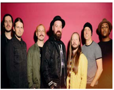
Live Music performance by The Motet